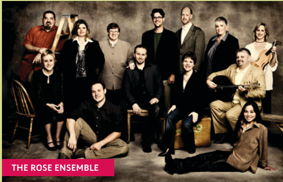
THE ROSE ENSEMBLE